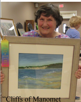
“Cliffs of Manomet “